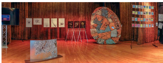
Art Exhibition: Beneath the Surface: Artists in the Estuary

To view the 2017 SOE Twitter Feed or the session abstracts, click here .