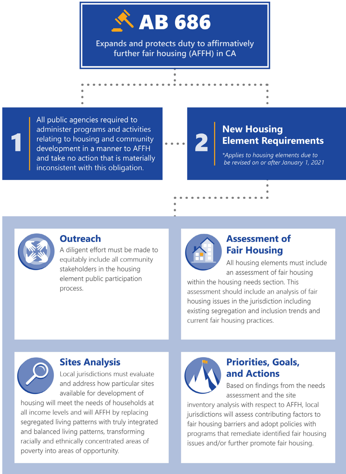
Chart 1: Summary of AB 686 Requirements