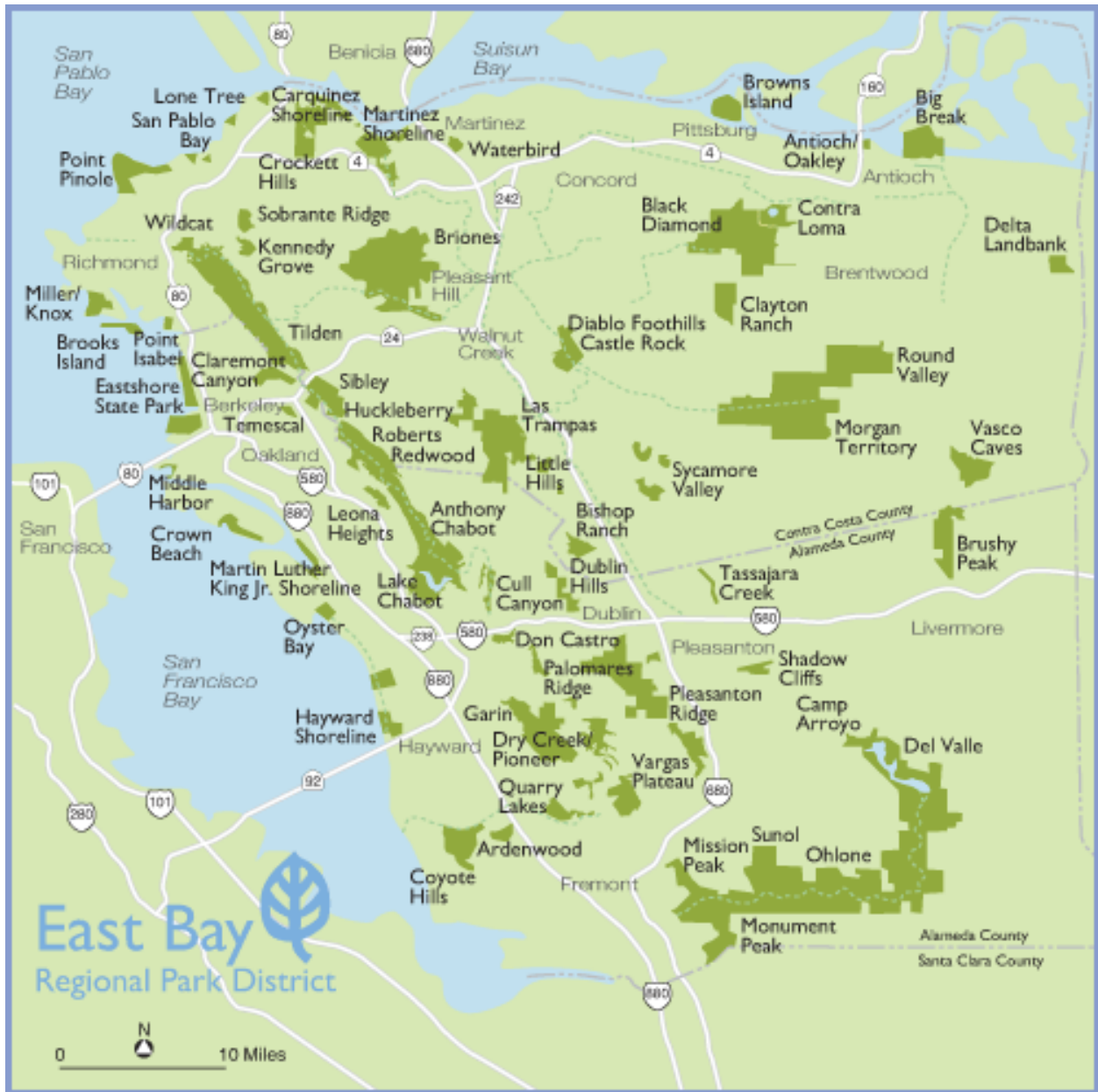
Exhibit A - District Boundary Map