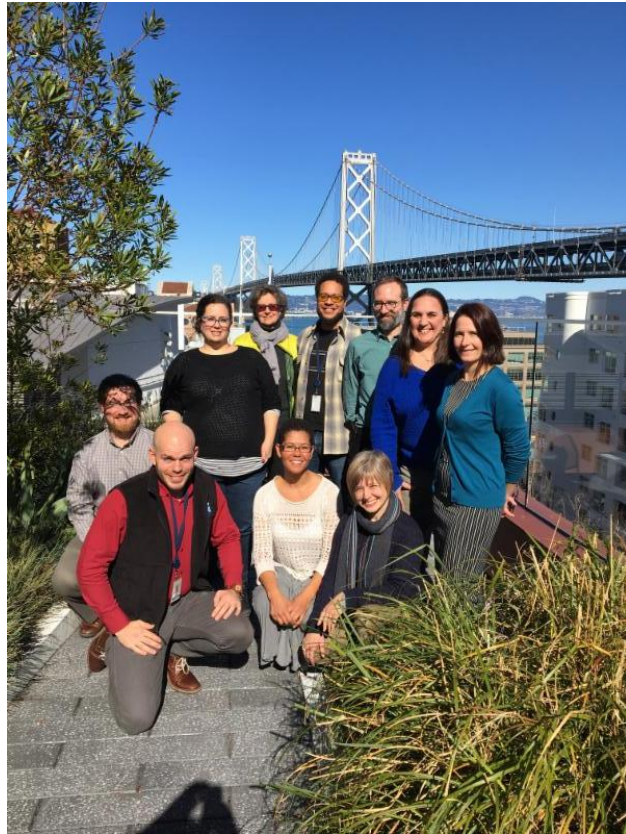
San Francisco Estuary Staff on the 8th floor roof deck at the Bay Area Metro Center