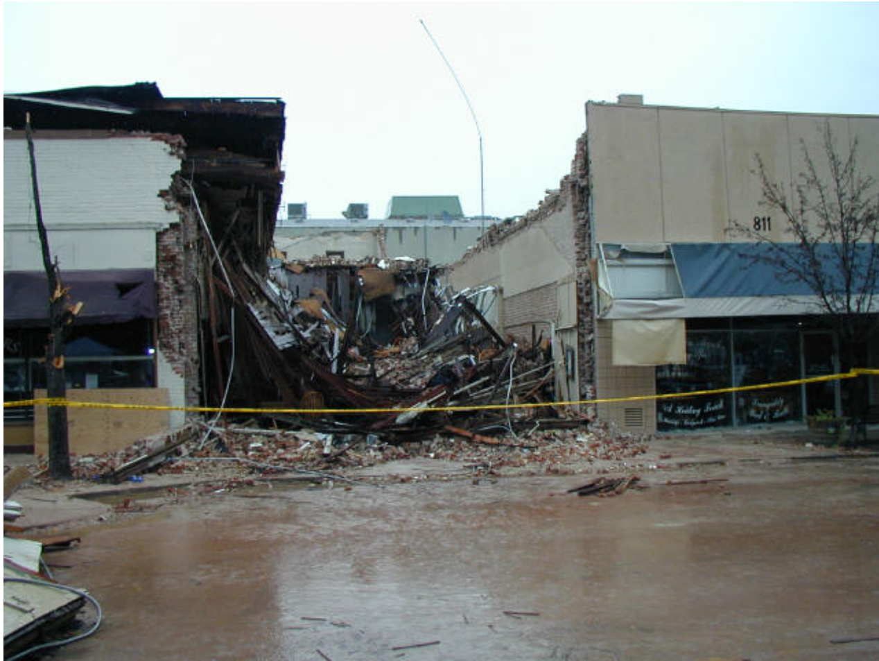
Retrofit Funding for Public Buildings