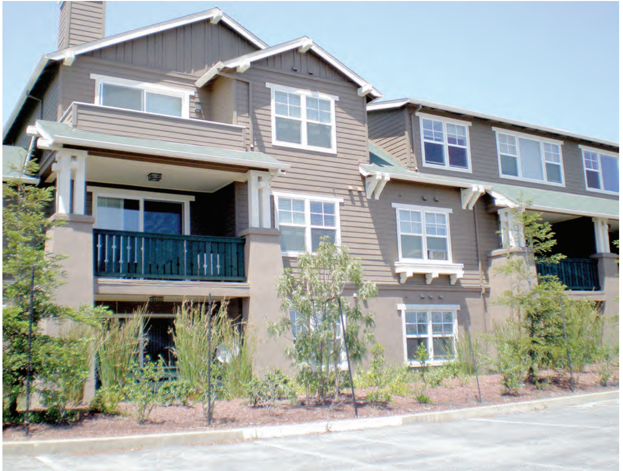
College Vista, Canada College, Redwood City

The RHNA methodology includes a factor that directs lower allocations to jurisdictions that permitted more very low- and low-income units during the 1999–2006 RHNA period. This factor rewards jurisdictions that have succeeded in expanding the range of affordable housing options in their communities.