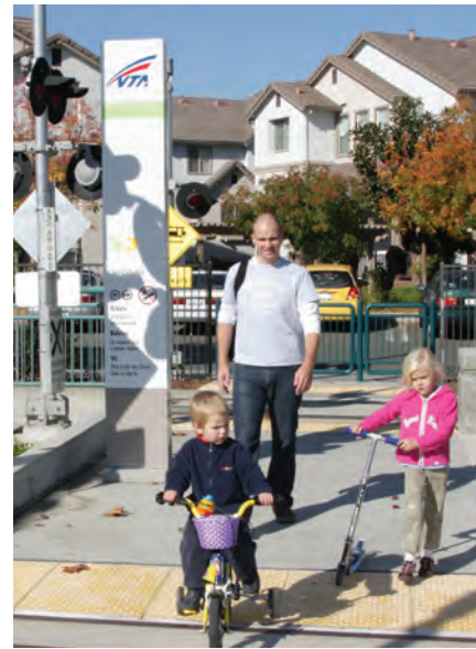
Priority Development Area, Mountain View

The SCS land use distribution is an initial input into the RHNA methodology. 5 For the period between 2015 and 2023, the SCS accommodates RHNA by allocating the pre-determined regional housing need from HCD to local jurisdictions consistent with the land use criteria specified in the SCS. The SCS uses the RHNA as the housing growth pattern for the period between 2015 and 2023. Through this process, the region's housing, transportation, and land use planning are aligned.