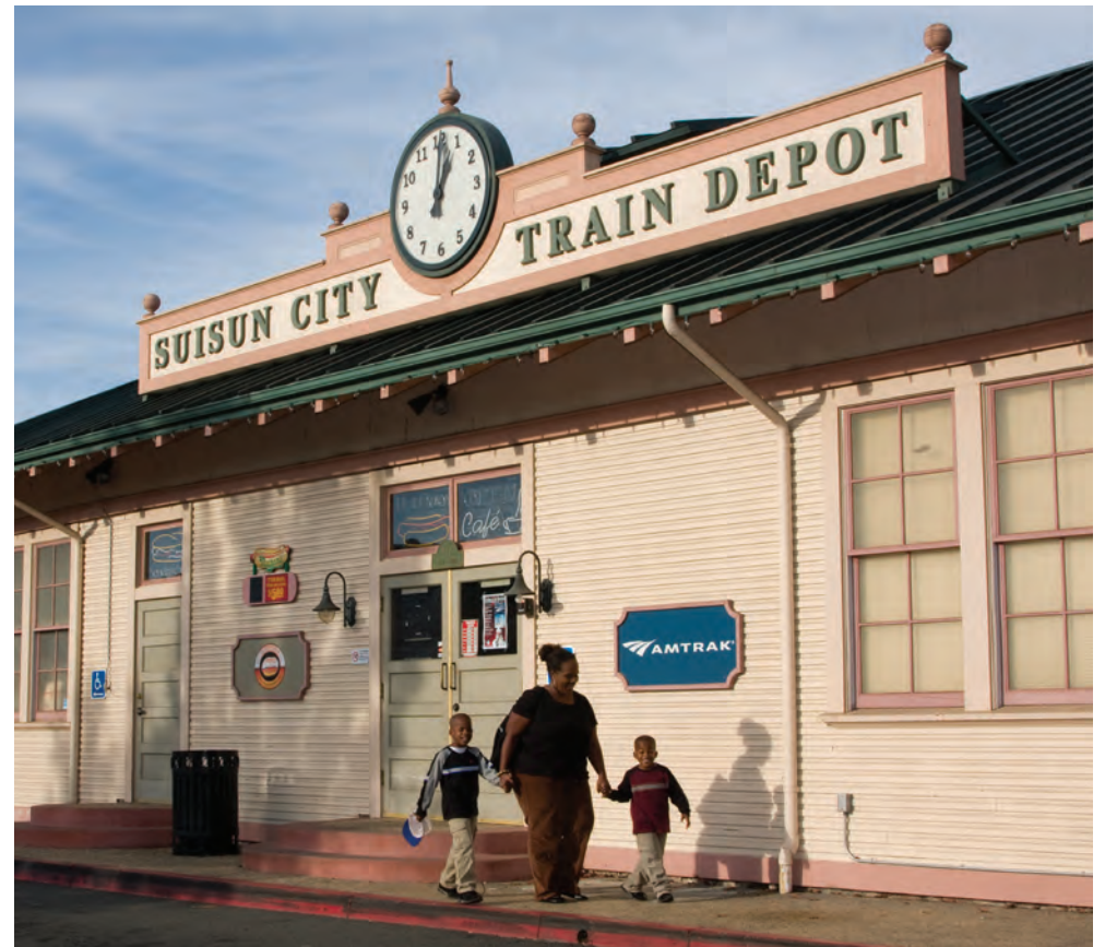
Suisun City Amtrak Station

to occur after 2022, so ABAG shifted 3,500 housing units (1.5 percent of the regional total) from these locations to the balance of the region during the RHNA period. These adjustments do not change the 2010–2040 long-term growth totals in the SCS.