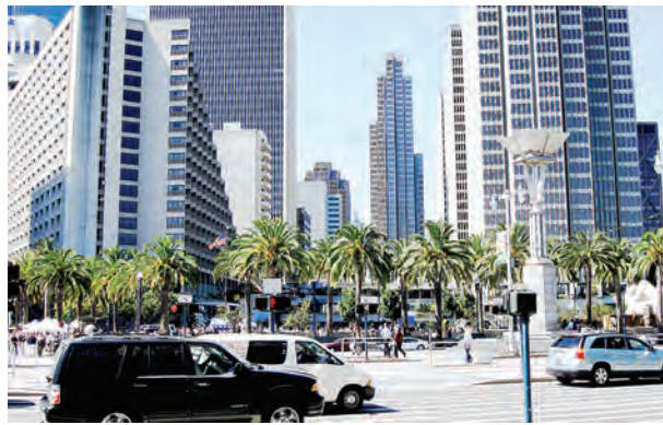
Embarcadero, San Francisco

The income allocation method compares each jurisdiction’s household income distribution to the regionwide household distribution, based on data from the US Census 2005–2009 American Community Survey. A jurisdiction that has a relatively higher proportion of households in a certain income category receives a smaller allocation of housing units in that same category. For example, jurisdictions that already supply a large amount of affordable housing receive lower affordable housing allocations. This promotes the state objective for reducing concentrations of poverty and increasing the mix of housing types among cities and counties equitably.