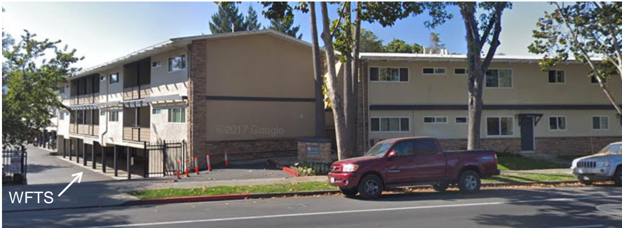
Different buildings on same parcel. Left: 3-story, WFTS, parking below grade. Right: 2-story, No WFTS