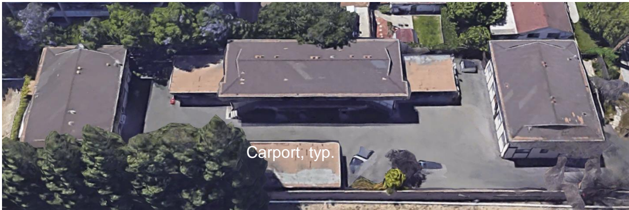
Three 2-story buildings (13 units total). No WFTS; parking provided under adjacent carports.