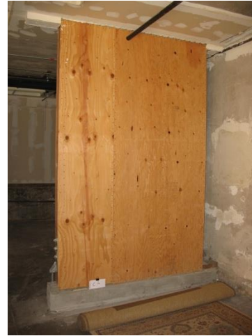
2B. New stand-alone wood shear wall with new concrete footing