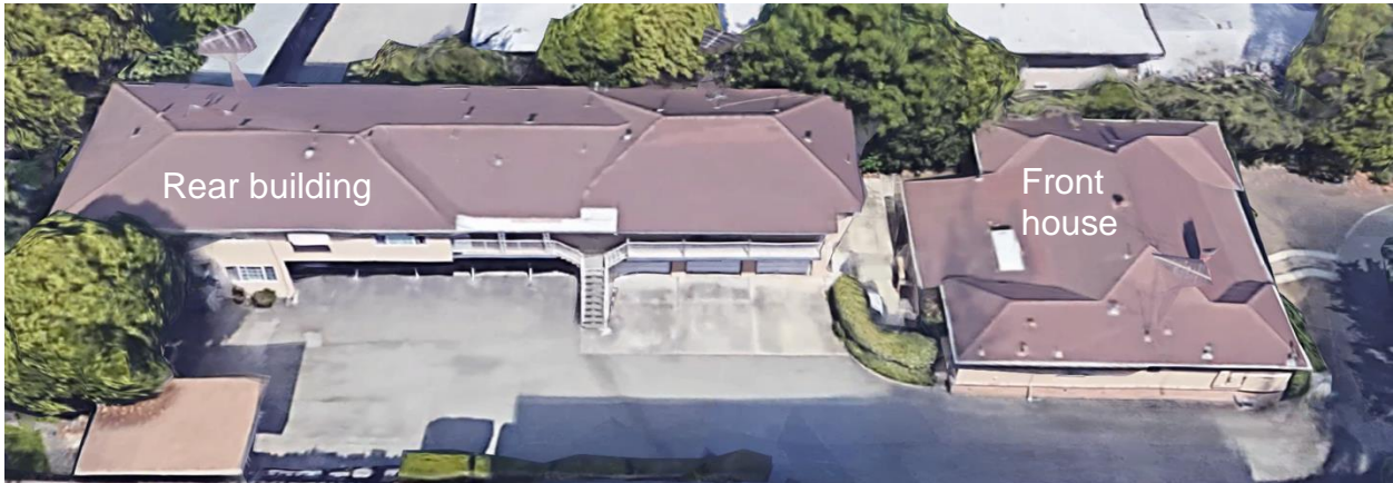
Front house (1 unit), with rear 5-unit 2-story building. Rear building presents WFTS condition.