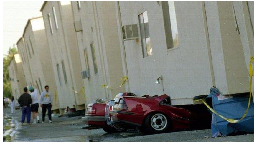
1D. Collapsed 3-story building, Los Angeles, Northridge earthquake

A collapsed soft story building adjacent to a public way also threatens public safety and blocks sidewalks and streets. Where soft story buildings comprise a large portion of a city’s housing stock, the aggregate effect of their poor performance can exceed emergency shelter capacity, exacerbate housing shortages, and delay recovery citywide.