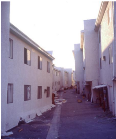
1B. Left: Collapsed 3-story building. Right: Sidesway damage, Los Angeles, Northridge earthquake